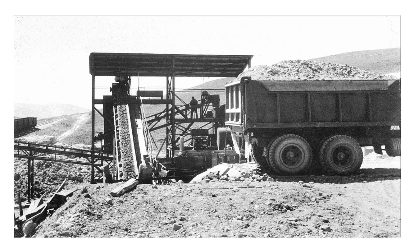
Figure 126. Loading Centennial Mine phosphate ore at Monida, Montana, September 23, 1957.