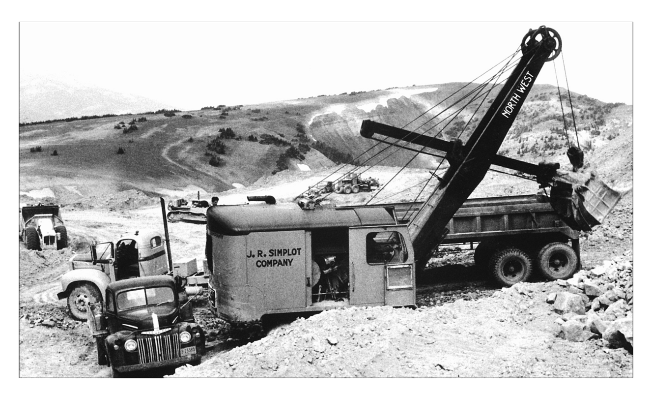
Figure 125. Centennial Mine, September 23, 1957. BLM file photo.